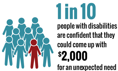
FIGURE 1. Many people already struggle to pay for the basics. Paid leave is a must.